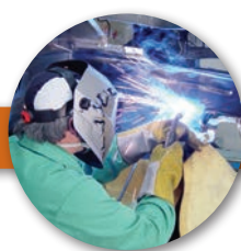
Welding Training & Certification™