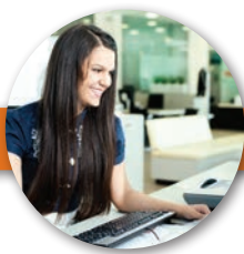
Intro to Collision Repair Series

I-CAR has recently expanded its industry recognized Steel and Aluminum Welding Training & Certification programs to be delivered by Career & Technical schools that are PDP-EE curriculum licensed users. The I-CAR WT&C program goes beyond the standard PDP-EE curriculum program and includes a comprehensive Educator training session, student materials and an infrastructure readiness assessment for the school. There is no charge for the Educator to receive the I-CAR Educator Welding Certification.